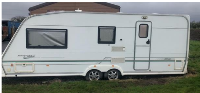
North facing elevation

Internal length 5.82metres External length 7.54 metres Width 2.24 metres wide