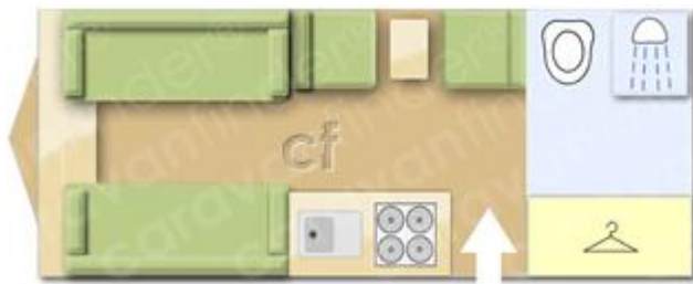
Indicative internal layout

Internal length 5.82metres External length 7.54 metres Width 2.24 metres wide