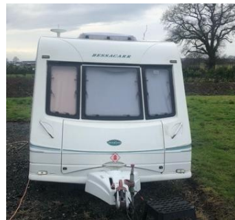
East facing elevation